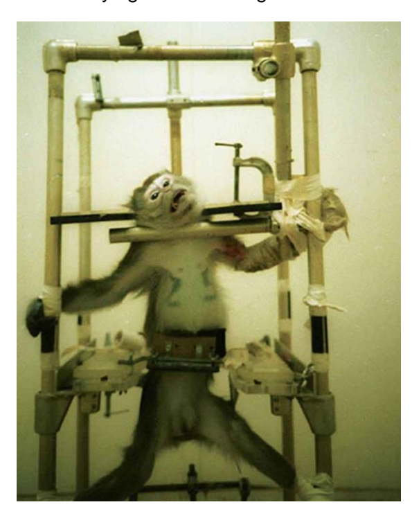
Figure 2: Photograph from a PETA investigation into lab experiments on macaque monkeys, Maryland, 1981. The resemblance to images of human torture is unmistakable.

In sum, it would be difficult to fully explain many major shifts in political history – especially the expansion of rights regimes – without including the role of empathy. Although organizing strategies, ideologies, leadership and other factors all play a role in social change, empathy is essential for forging the social connections that make us care about the plight of others, and is an underlying force creating bonds of common interest and solidarity.