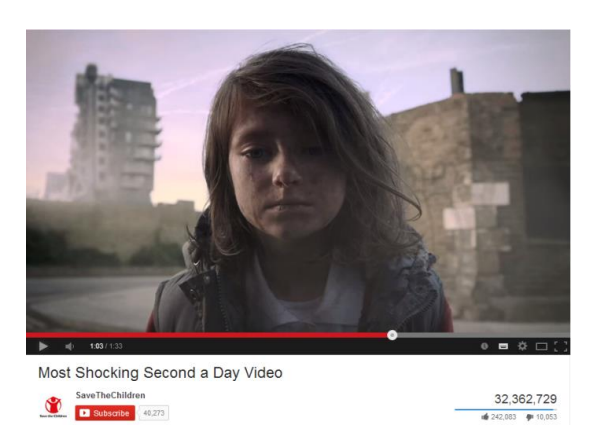
Figure 3: From top left clockwise: Dialogue in the Dark, Klima X in Finland, Save the Children's Most Shocking Second a Day Video, Friends of the Earth's Infernal Combustion installation.

This is just a sample of campaigns and actions that draw on experiential, conversational and cultural empathy to help people step into the shoes of others. Further examples include ethical consumer campaigns that help us empathise with the poor labour conditions of sweatshop workers in developing countries, videos and blogs in which flood victims in the North and South talk directly about their experiences, and photographic exhibitions of the human impact of natural and man-made disasters.